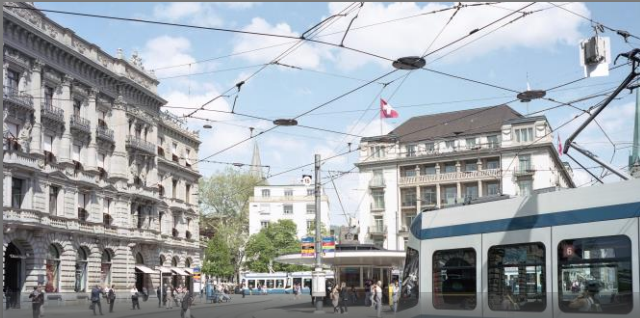
Swiss Financial System