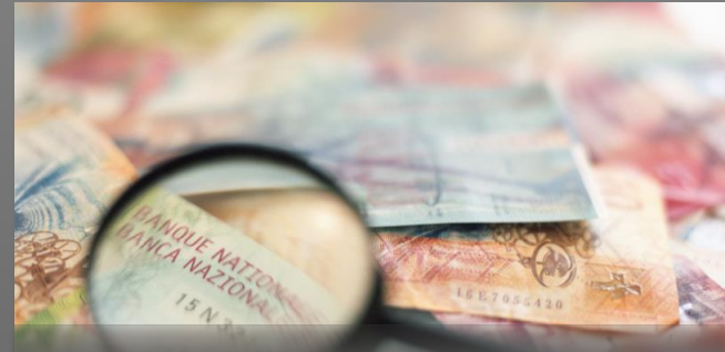
Fundamentals of Finance